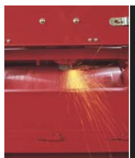
In minutes, you can sharpen knives for uniform cutting and top fuel efficiency. A large, 3-in.-diameter sharpening ratchet-advanced stone passes over the length of the knives for an evenly sharpened cutterhead.