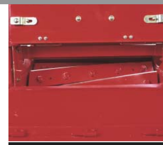
At the heart of the Case IH Model FHX300 is this 21-in.-diameter, 12-knife cutterhead. Hardened alloy knives span the full width of the cutterhead and chop evenly and efficiently, converting your crop into high-quality feed.

There's much more to tell! Get a closer look at the FHX300 and learn the full story at your Case IH dealer.