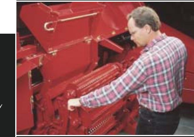
The Case IH feedrolls lift up for easy cleaning and inspection of the shearbar and smooth roll scraper. There's no need to take the feedrolls out of the machine, and no need to remove the crophead to lift the upper feedroll.